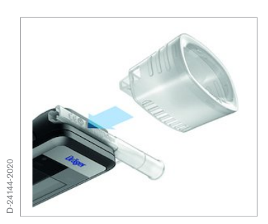
Fast switchover from funnel-based to mouthpiece-based testing