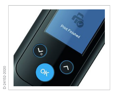
Simple push-button print function