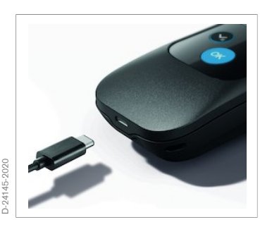
USB-C Interface for easy charging of the lithium version (while stationary or on the move)