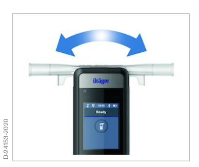
Mouthpiece receptacle can be mounted on left or right