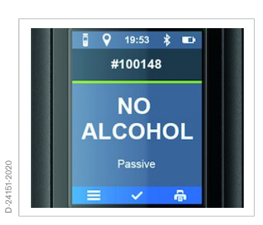
The 2.4" colour display provides information, notices and warnings