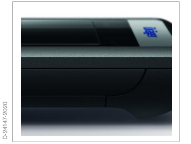
Rubberised handling area for a secure