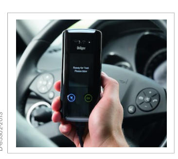
2. Request to provide a breath sample